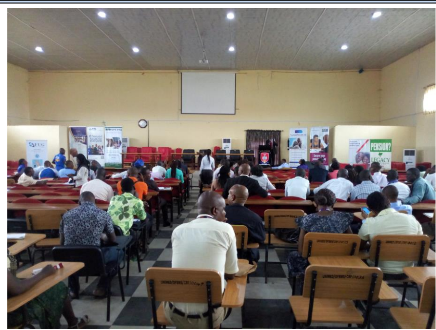
A cross-section of participants at the interactive session with Pension Fund Administrators.

interactive session was organized to ensure that accounts and records with PFAs are accurate. He said the management team of UNIMED prioritizes the immediate and future welfare of members of staff.