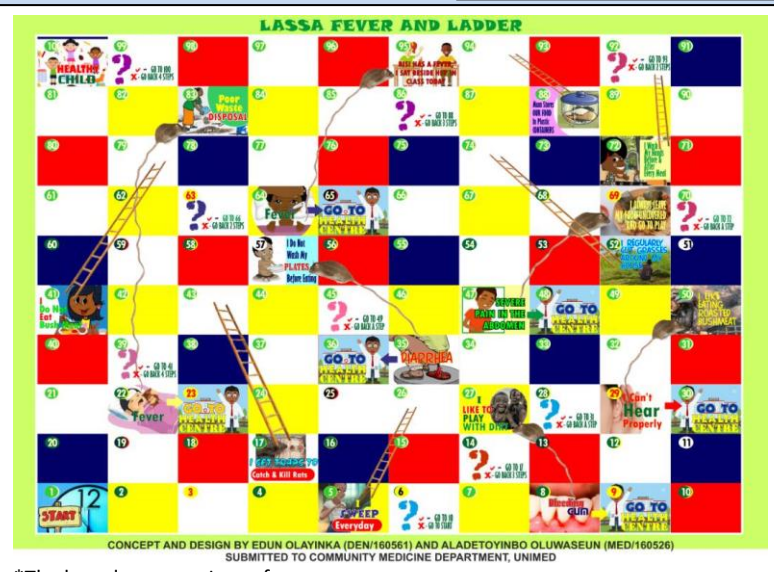
*The board game on Lassa fever